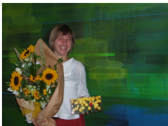
Some moment of the "vernissage"

The AlpCity team wishes her good luck for her career!