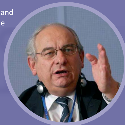
Michel Delebarre President of the Committee of the Regions

The Lisbon Agenda must be owned by all stakeholders at EU, national, regional and local levels and mobilisation is possible only if the various players feel that the policies proposed concern them and that they are truly involved in the decision-making and implementation process. The Committee of the Regions is delighted to co-host this Conference where we see demonstrated the role of regional and local players in delivering the Lisbon Agenda on the ground.