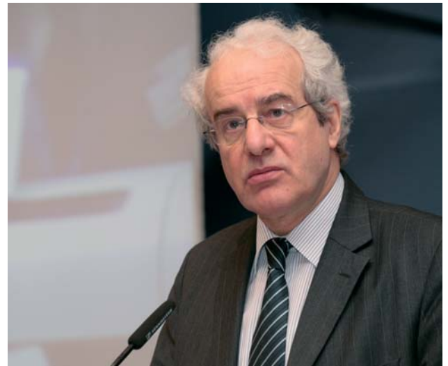
Philippe de Buck

“If relationships are important to innovation-based economic development it is clear that regional policy must further develop the approach based on networking and co-operation. There is no contradiction between the title of the conference ‘Fostering competitiveness’ and the principles of co-operation we advocate. Modern economics teaches us that whenever resources are scarce there are competitive pressures to co-operate as there is an important correlation between trust and economic success.”