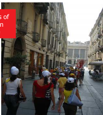
Some photos of the children exchange

Italian children will be hosted by the Community of Grainau in February 2007. It's a sure thing this exchange had a great success so that it would be possible to repeat these type of experience in the framework of transnational projects which can place its contacts at these purposes disposal.