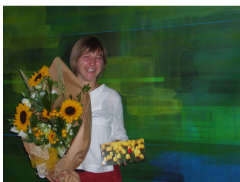
Some moment of the "vernissage"

The AlpCity team wishes her good luck for her career!