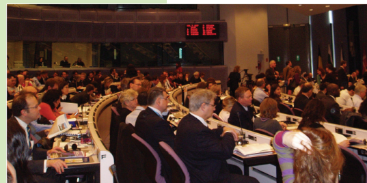
Regions for Economic Change, Plenary Session, Brussels

The new initiative "Regions For Economic Change" was adopted on 8 November 2006 by the European Commission relating to the "Territorial Cooperation" objective. It introduces new ways to dynamise regional and urban networks to help them work closely with the Commission, to have innovative ideas tested and rapidly disseminated into the "Convergence", "Regional Competitiveness and Employment" and "European Territorial cooperation" programmes (i.e. cross border and transnational).