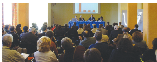
Audience at the AlpCity Final Conference (Pracatinat)