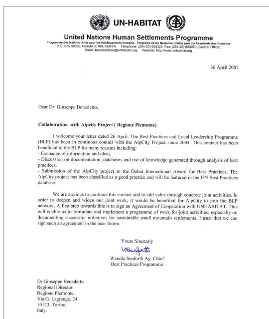
Un - Habitat Letter of Intent