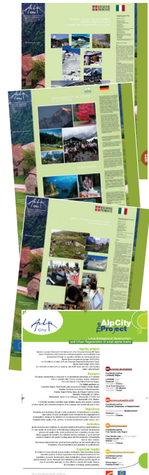
The case studies posters