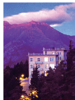
Pracatinat by night