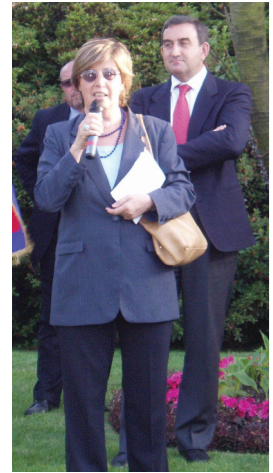
Mercedes Bresso, Piedmont Region President and Fabio Crococo, Italian Ministry of Infrastructure