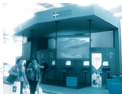
Regione Piemonte stand at the Forum PA - Rome